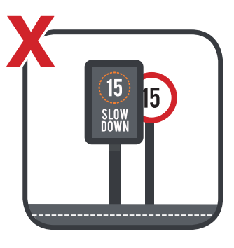
Do not obstruct any pre-existing road traffic signs