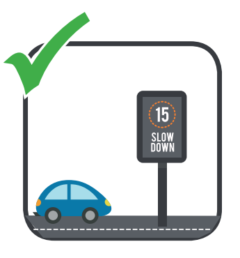
Must be clearly visible to approaching traffic, preferably on a clear straight road