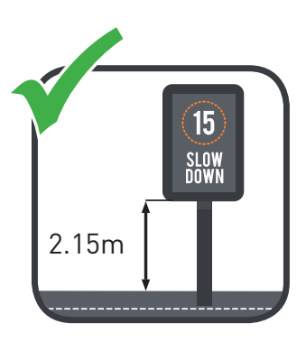
2.15m minimum between the base of the sign and the ground