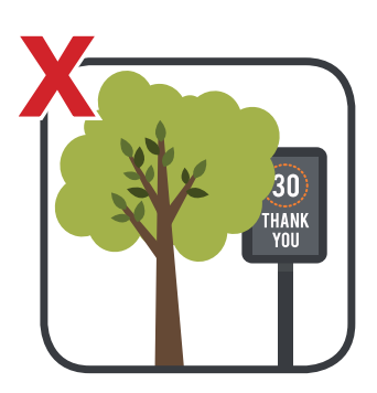
Avoid placing underneath overhanging trees/hedges, especially if using solar panels